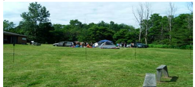
*some information was taken from the Spirits of the Earth facebook page*

But, I am already packing for KG!! Cya all there!!