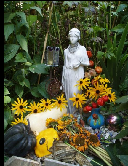
This is my Garden Altar at Autumnal Equinox.

Seeds are harvested at this time of year, apples, squash and onions are stored in cold cellars.